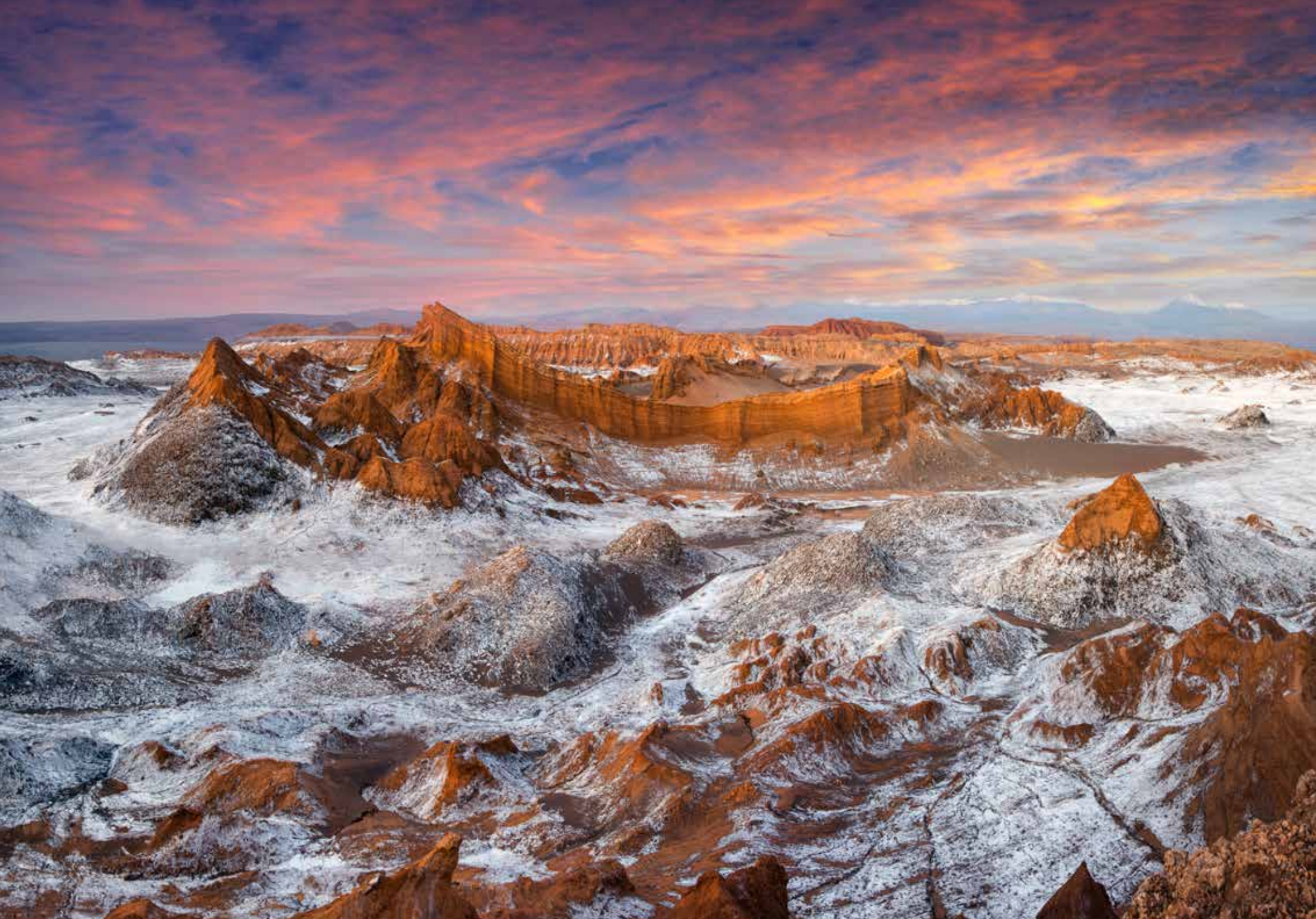
Achaches at sunset, Moon Valley

El Salar de Uyuni is an incredible place. The world’s largest salt flat at an elevation of 3656 meters. The large area, clear skies, and the exceptional flatness of the surface make the Salar an ideal object for calibrating the altimeters of Earth observation satellites. At night both the Atacama and the Altiplano are amazing locations to do some astro photography as the quality of the air is just superb.