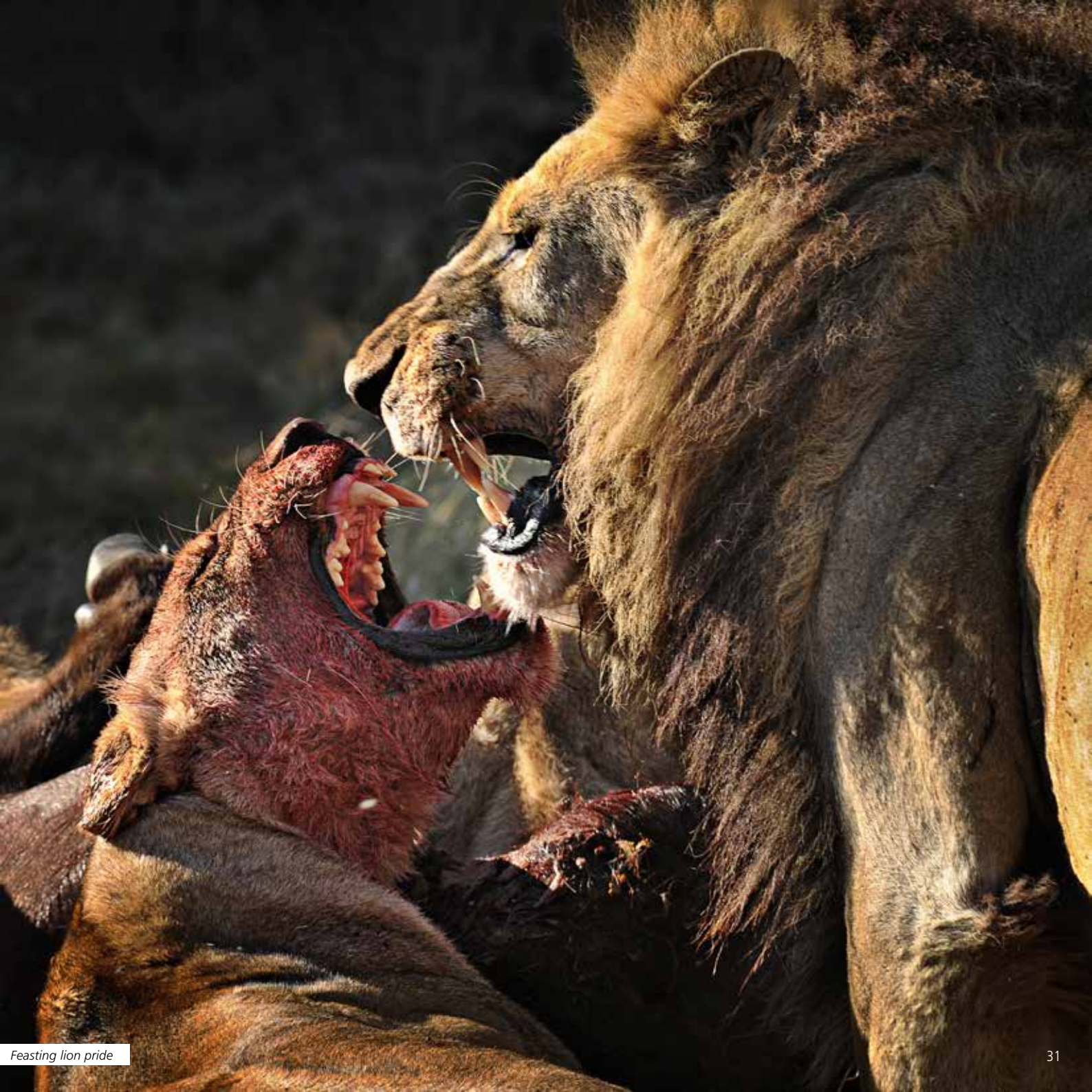
Feasting lion pride

To reserve your place for 2021 or to make an enquiry, please email ignacio@iptravelphotography.com.au