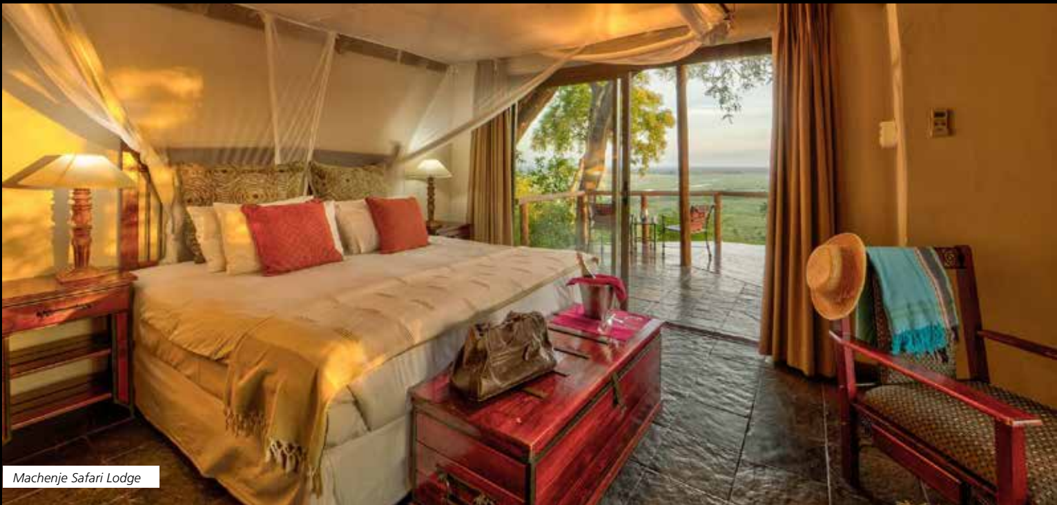
Machenje Safari Lodge