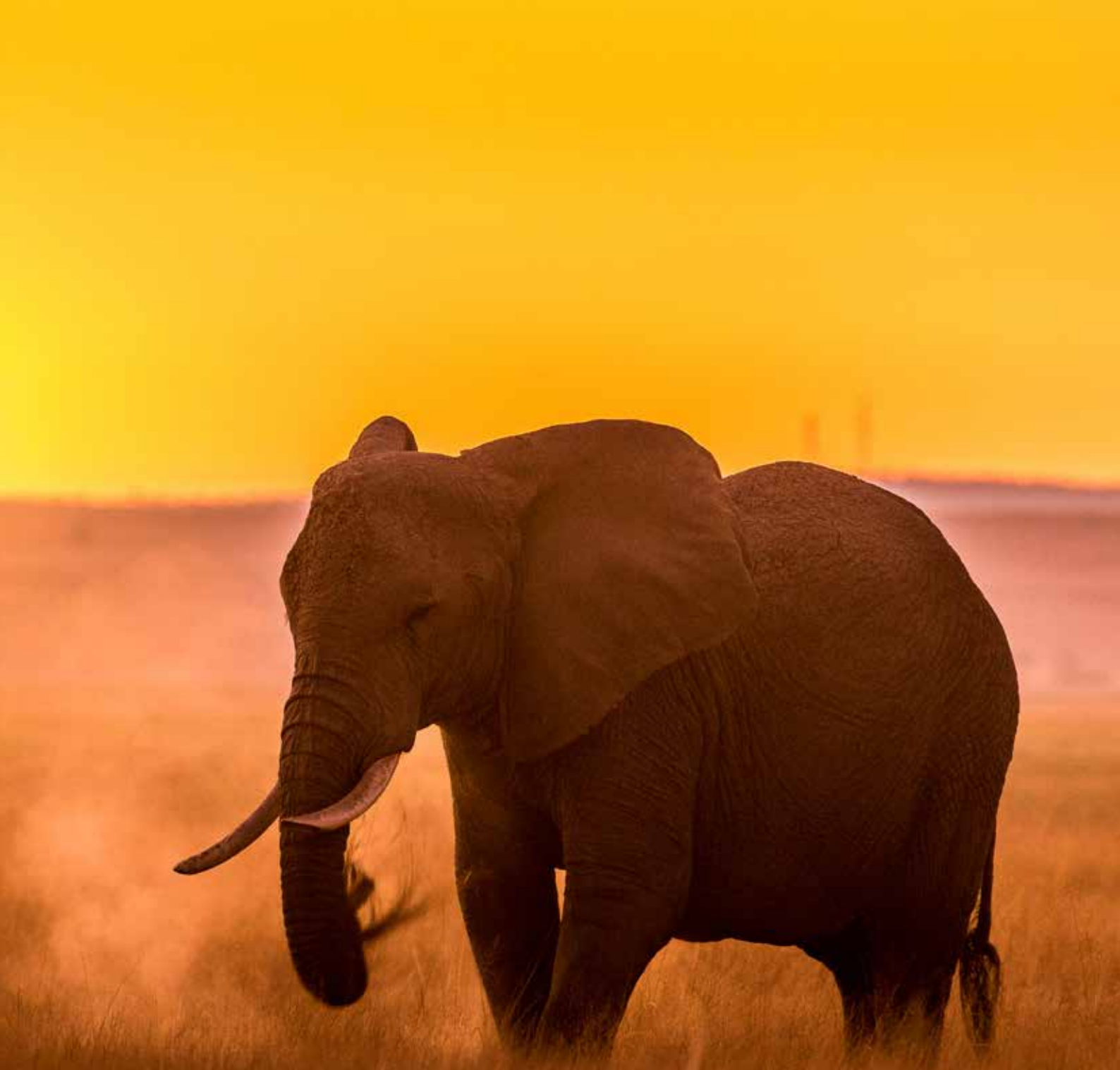
The mighty elephant

While you’ll be experiencing South Africa in style there will be times when the group needs to embark on a walk/hike to visit and photograph the best locations. As part of the pre-tour planning, we ask you share any existing health conditions with us so we may plan for your comfort and safety.