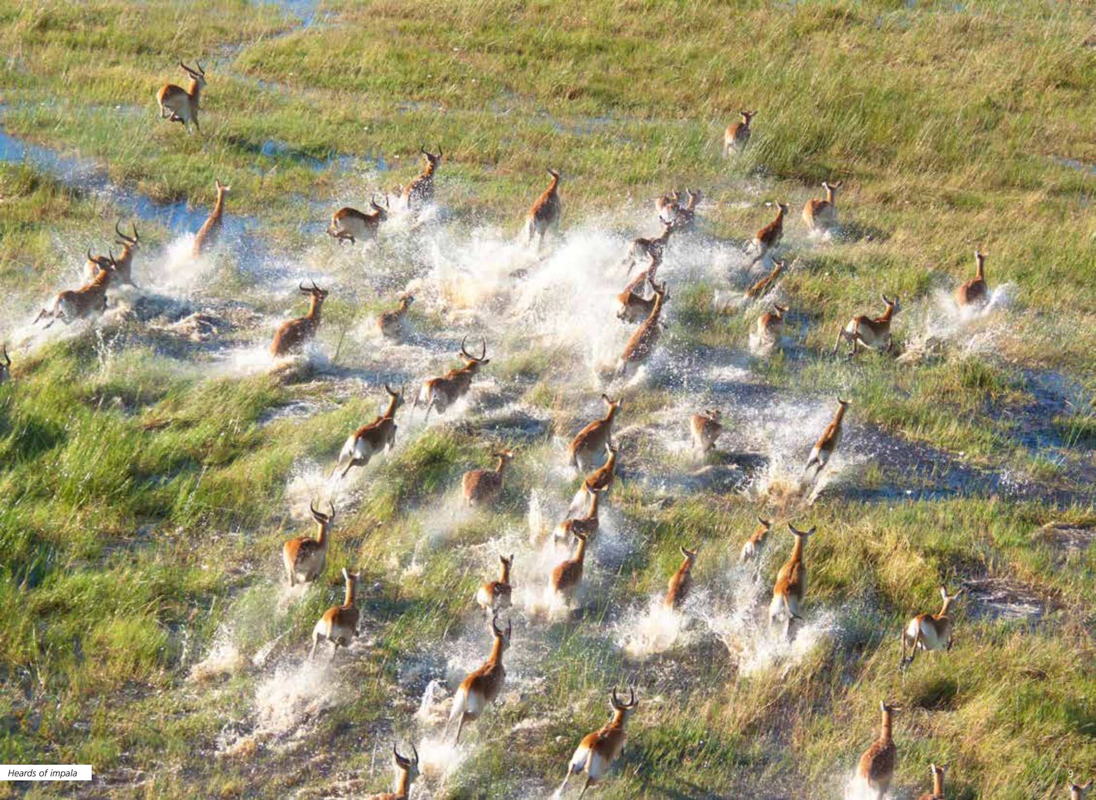
Herds of impala