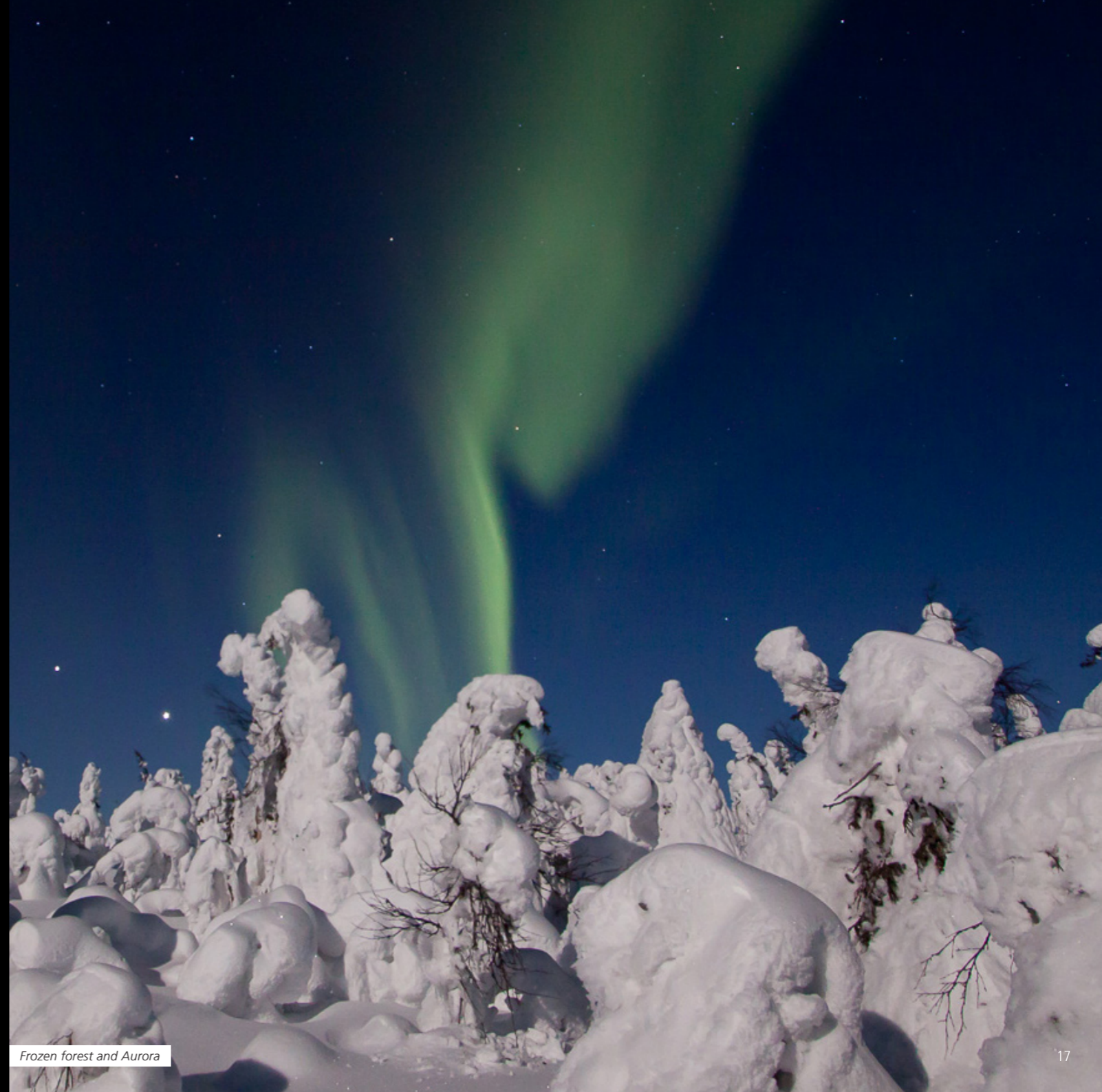
Frozen forest and Aurora

"I believe that photography can be way of change and I feel an obligation and responsibility to share what I have captured and created with my camera in the hope that I can not only inspire people to take better images but to care for the environment."