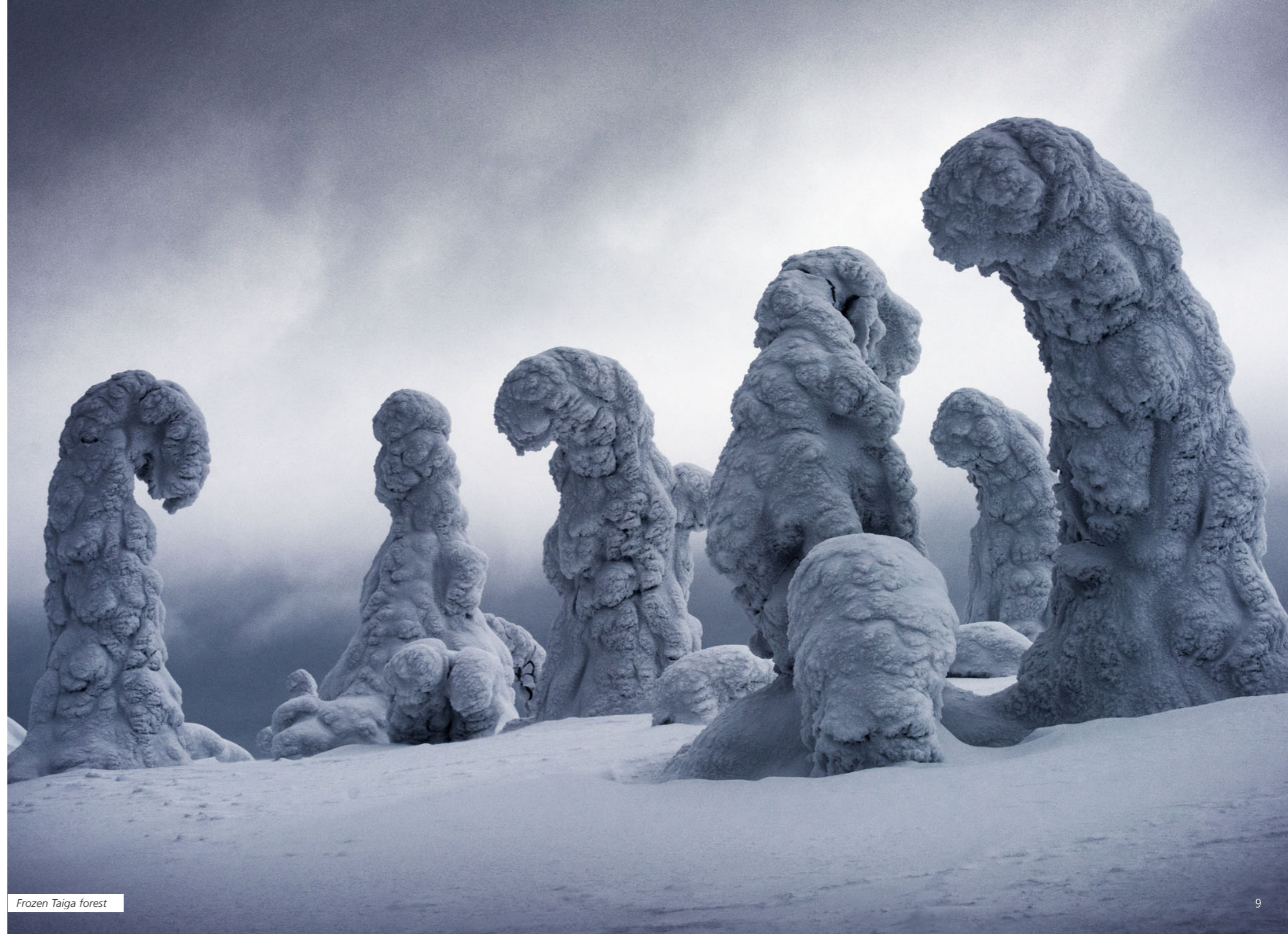
Frozen Taiga forest