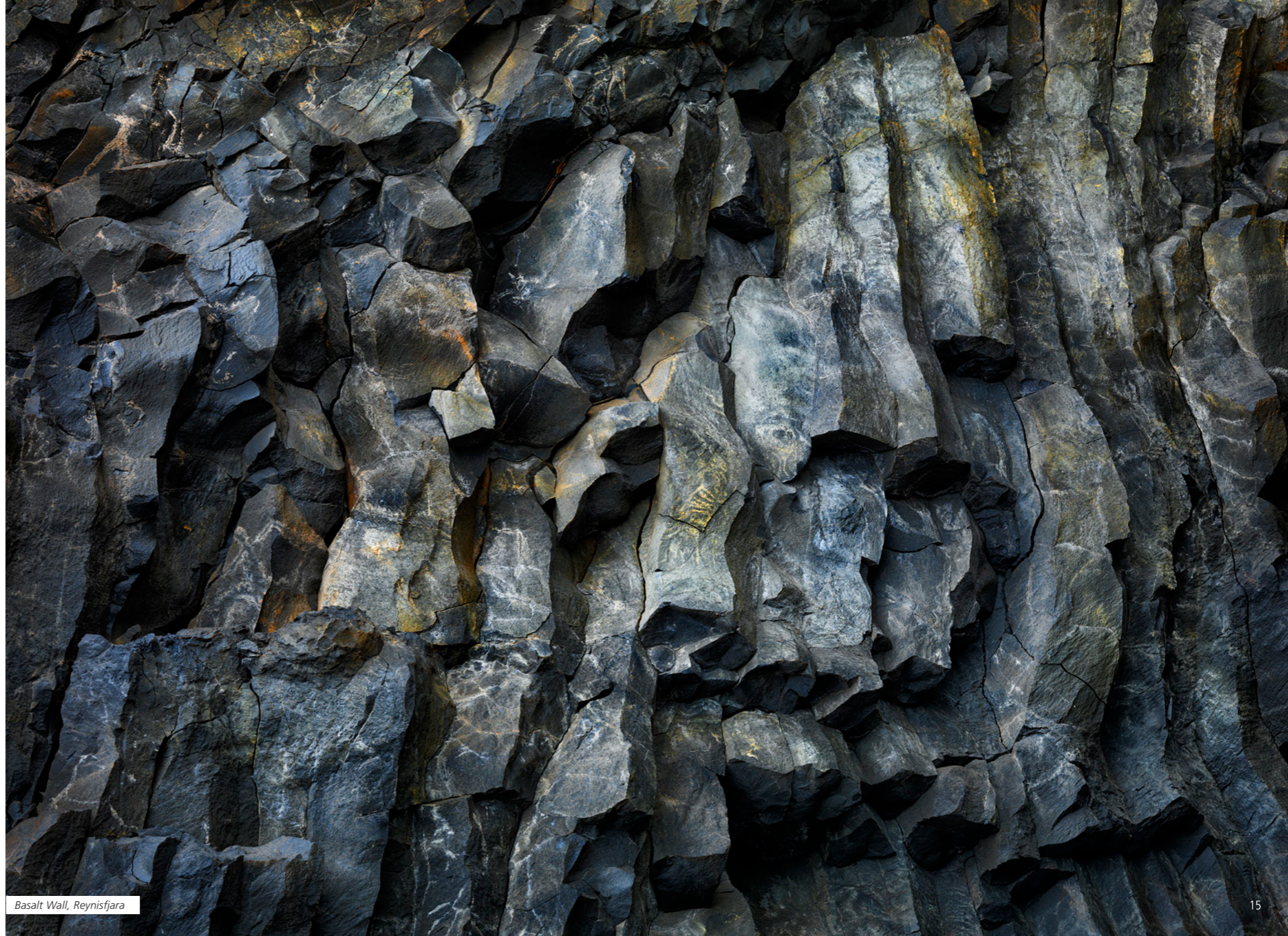
Basalt Wall, Reynisfjara