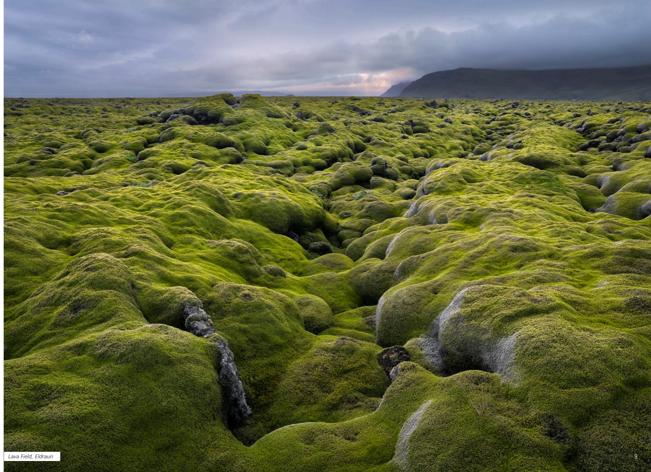
Lava Field, Eldraun

We check in at our hotel at Gullfoss and have dinner. After dinner we drive to the gigantic waterfall of Gullfoss and shoot the waterfall in late evening light.