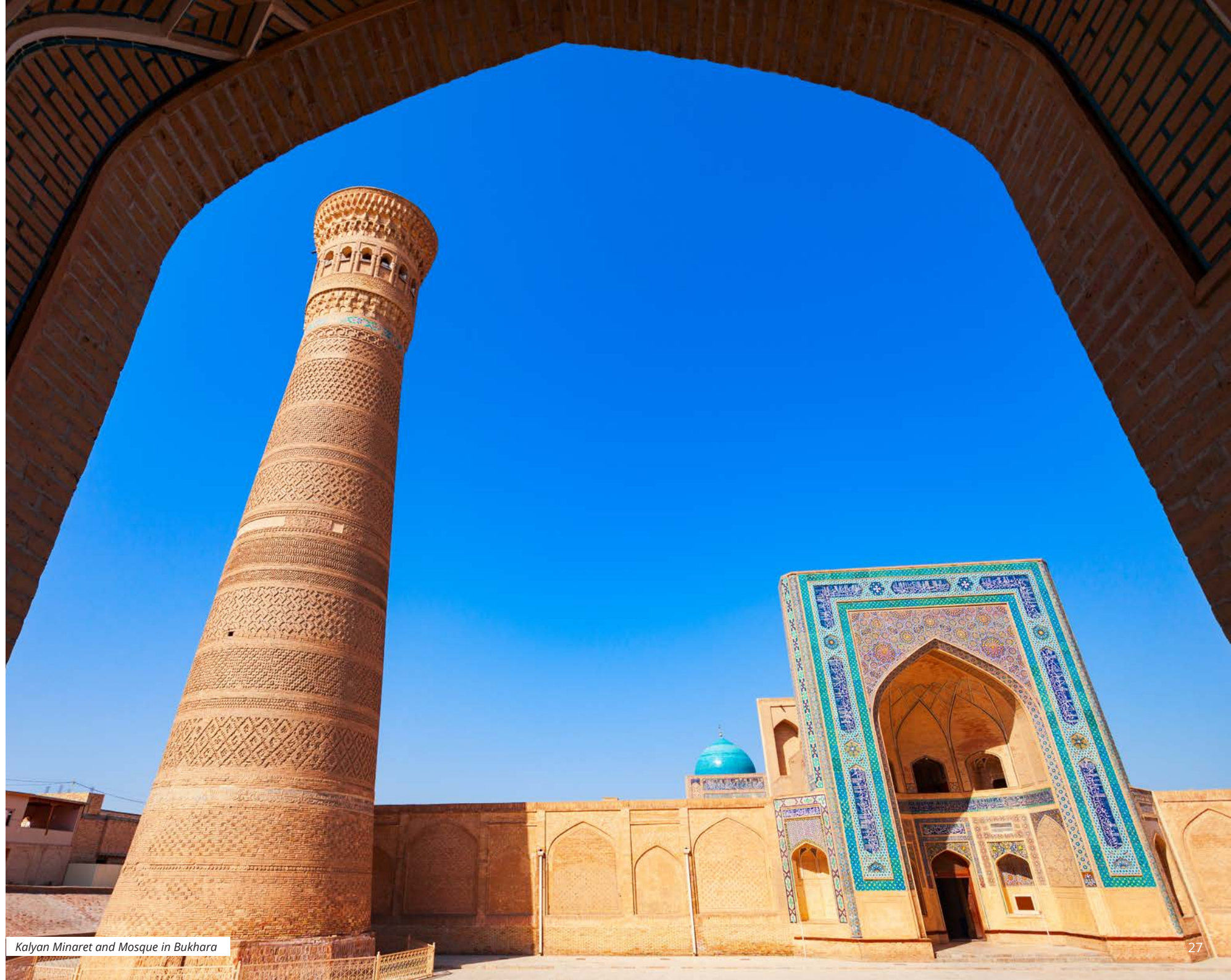
Kalyan Minaret and Mosque in Bukhara

Accommodation: Hotel 3-star (Old Bukhara Hotel or similar).