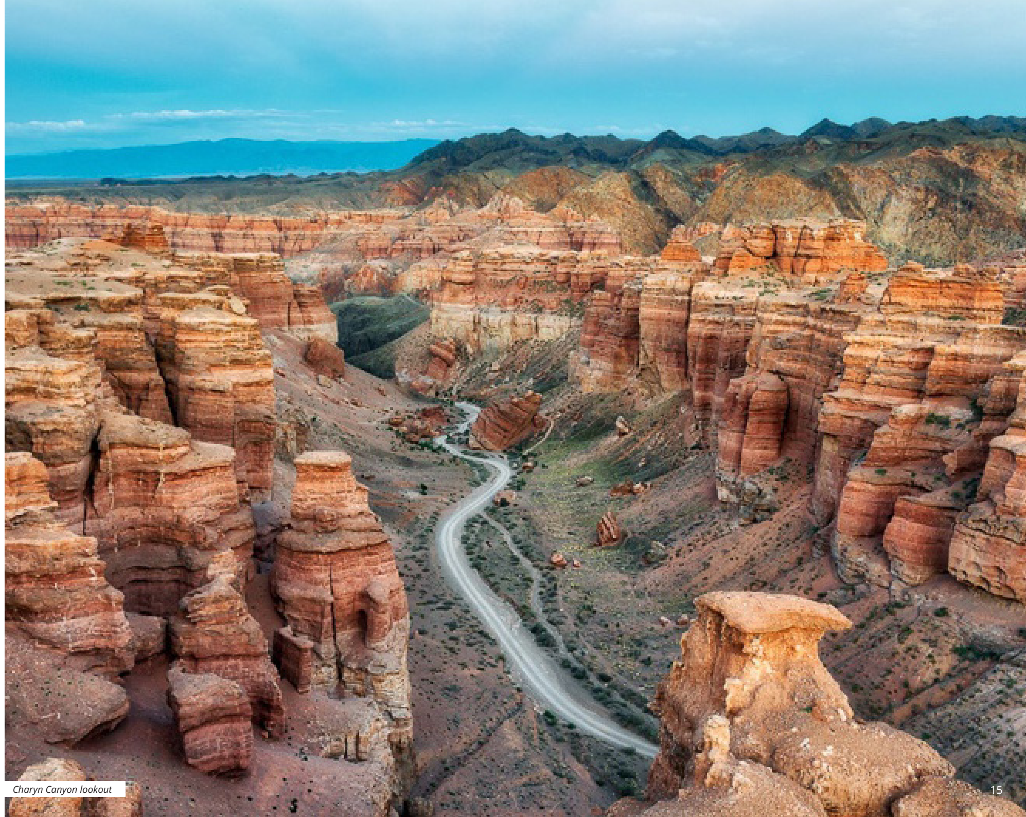
Charyn Canyon lookout

Accommodation at Holiday Inn Express or similar (4 stars).