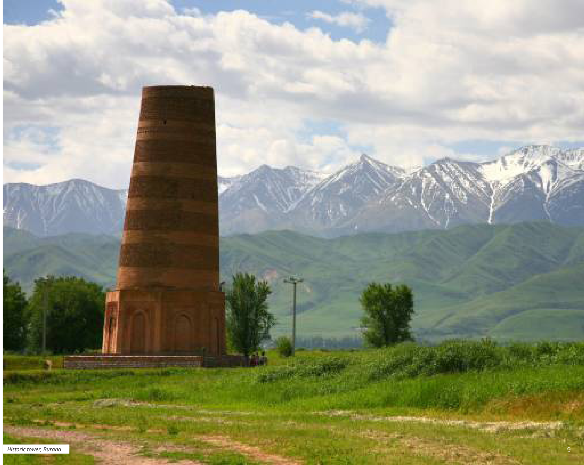
Historic tower, Burana

Accommodation at Kemin Guesthouse or similar.