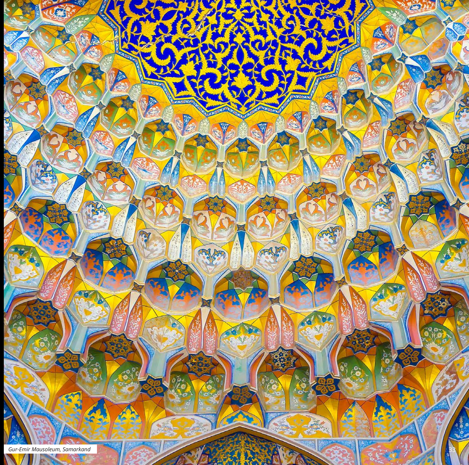
Gur-Emir Mausoleum, Samarkand