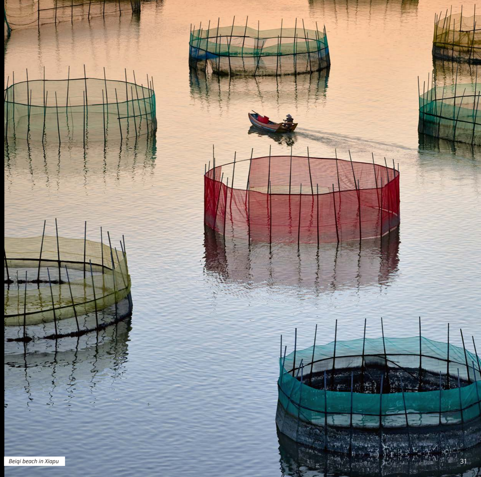
Beiqi beach in Xiapu