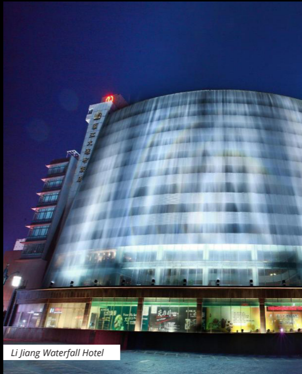
Li Jiang Waterfall Hotel