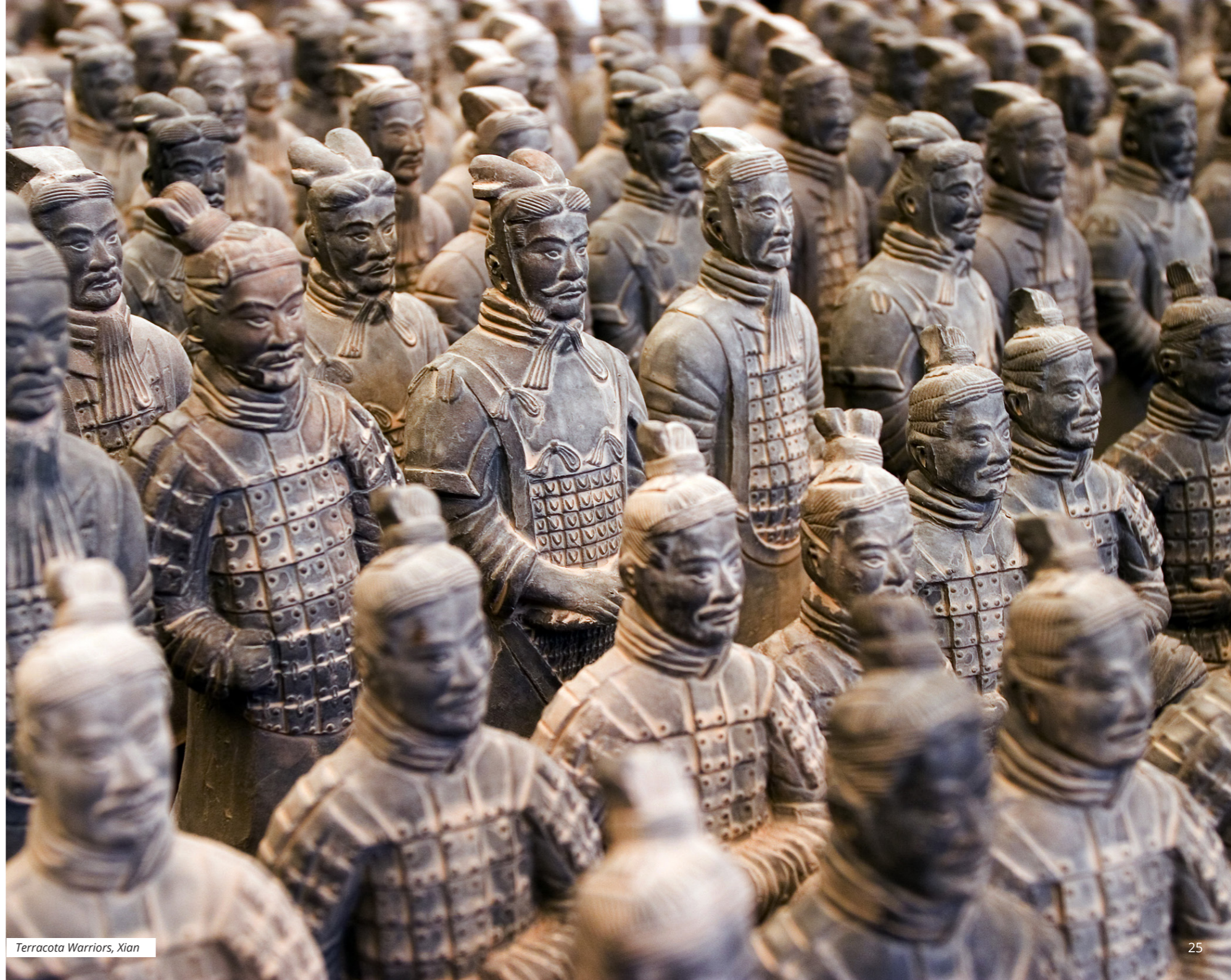
Terracota Warriors, Xian