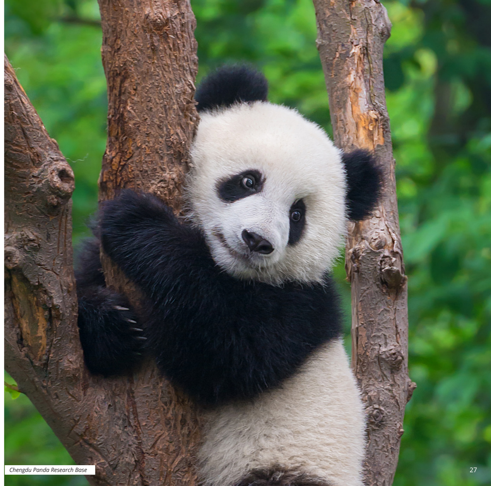
Chengdu Panda Research Base