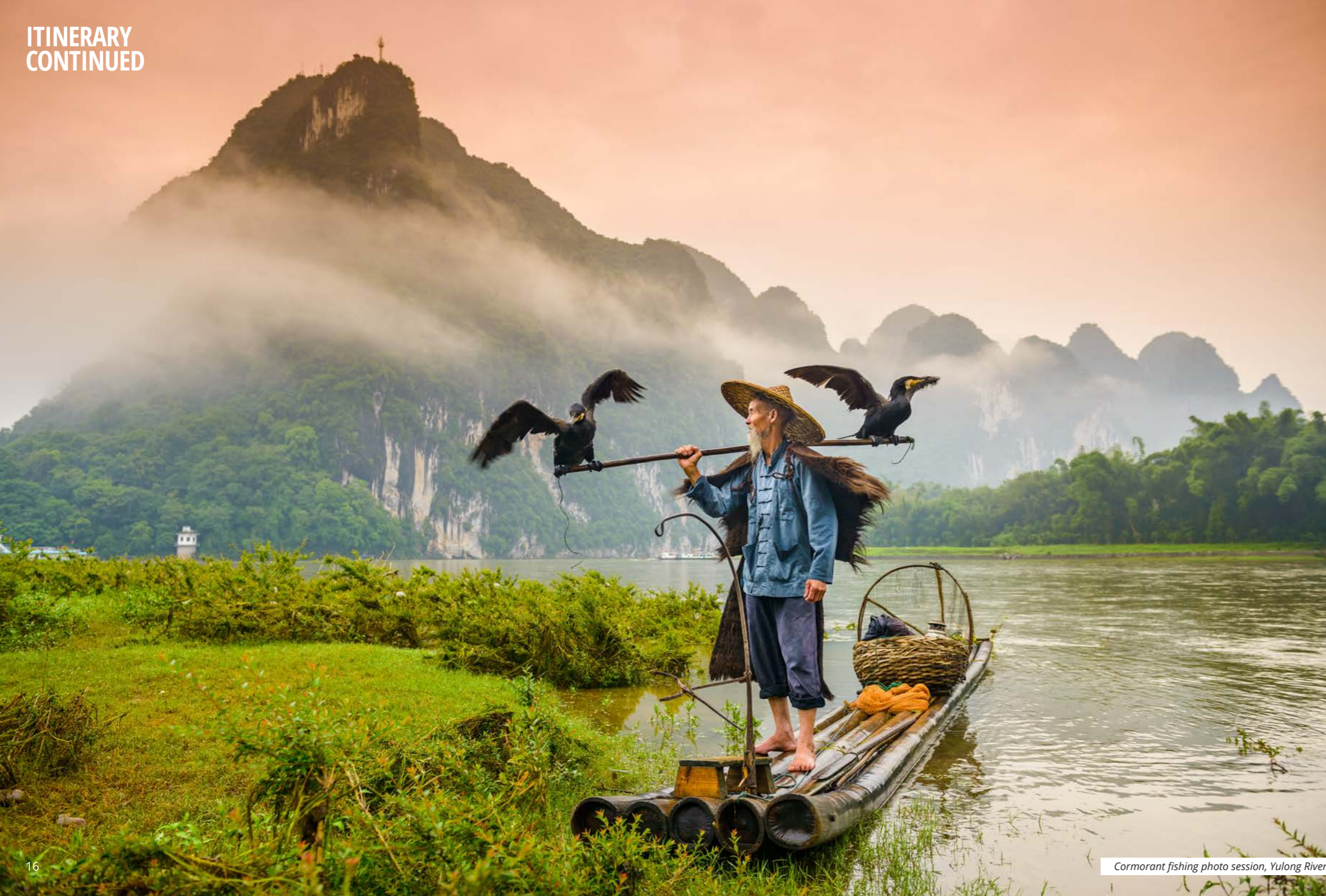
Cormorant fishing photo session, Yulong River