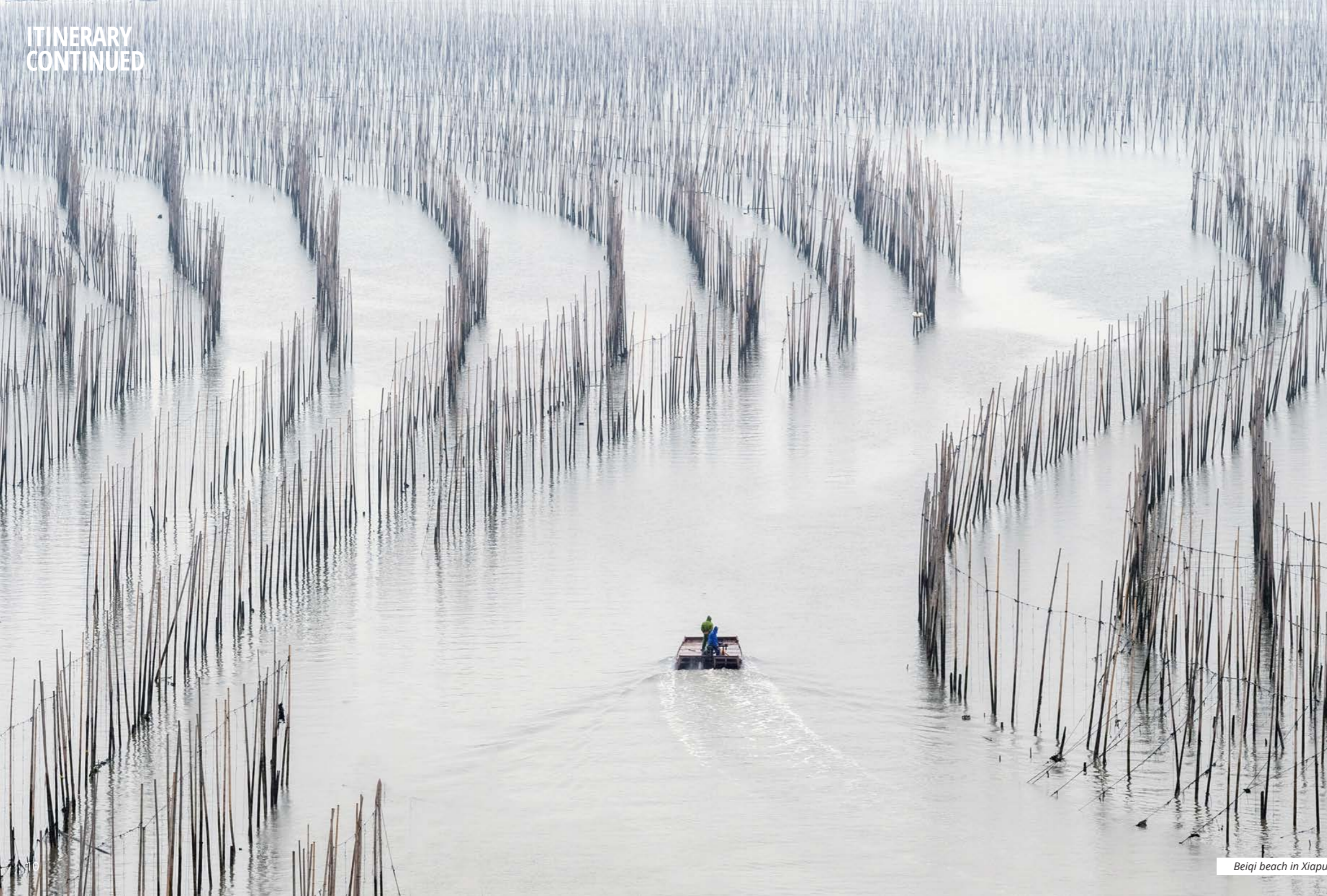
Beiqi beach in Xiapu