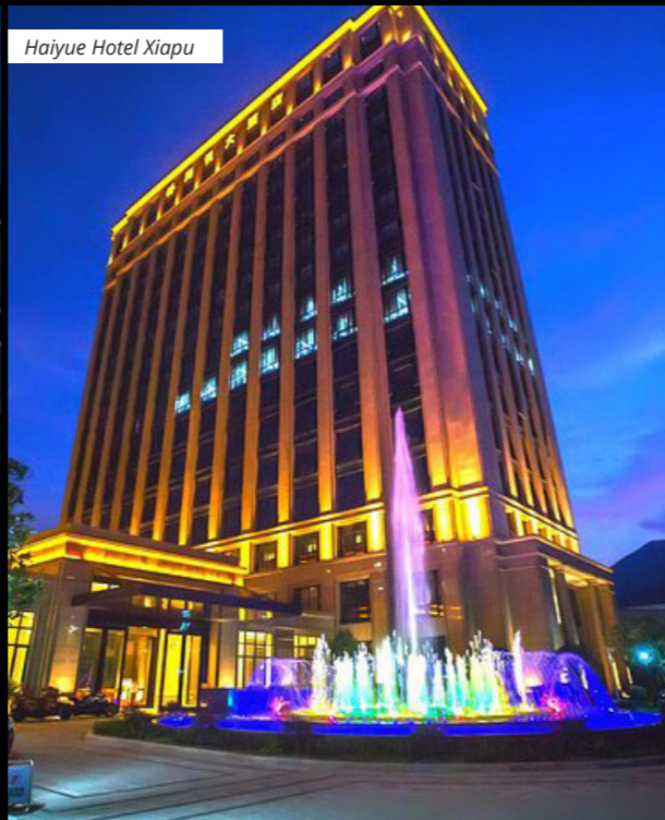
Haiyue Hotel Xiapu