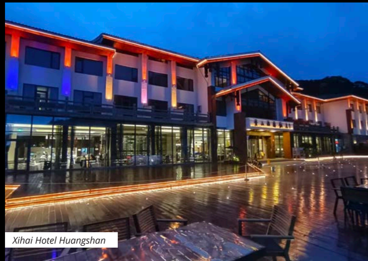
Xihai Hotel Huangshan