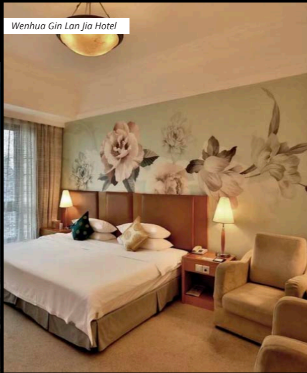
Wenhua Gin Lan Jia Hotel