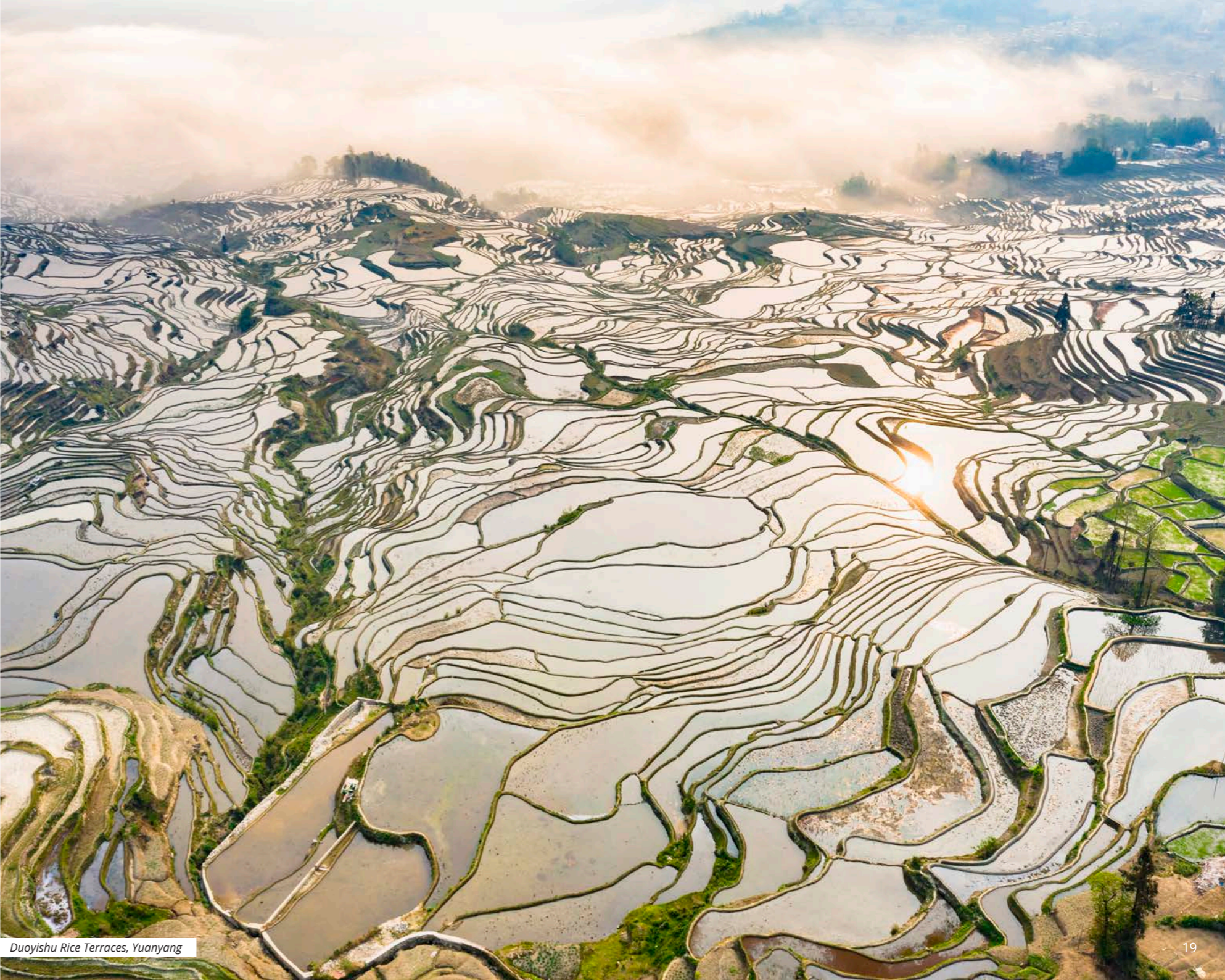
Duoyishu Rice Terraces, Yuanyang