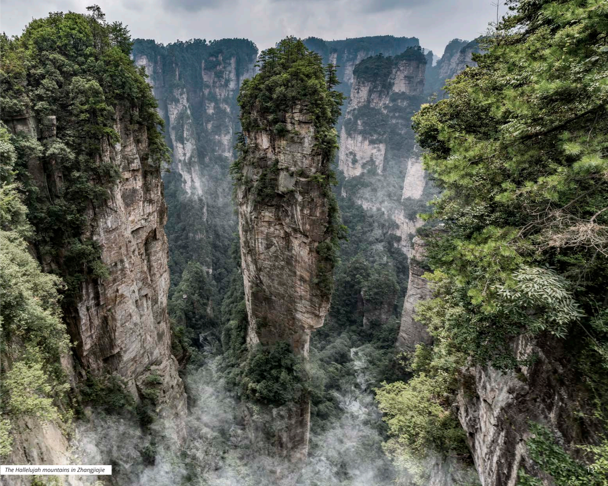
The Hallelujah mountains in Zhangjiajie