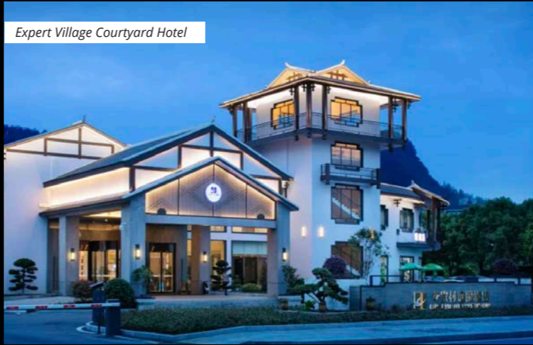
Expert Village Courtyard Hotel