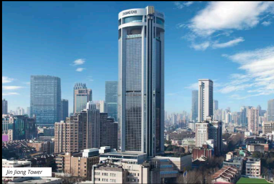
Jin Jiang Tower