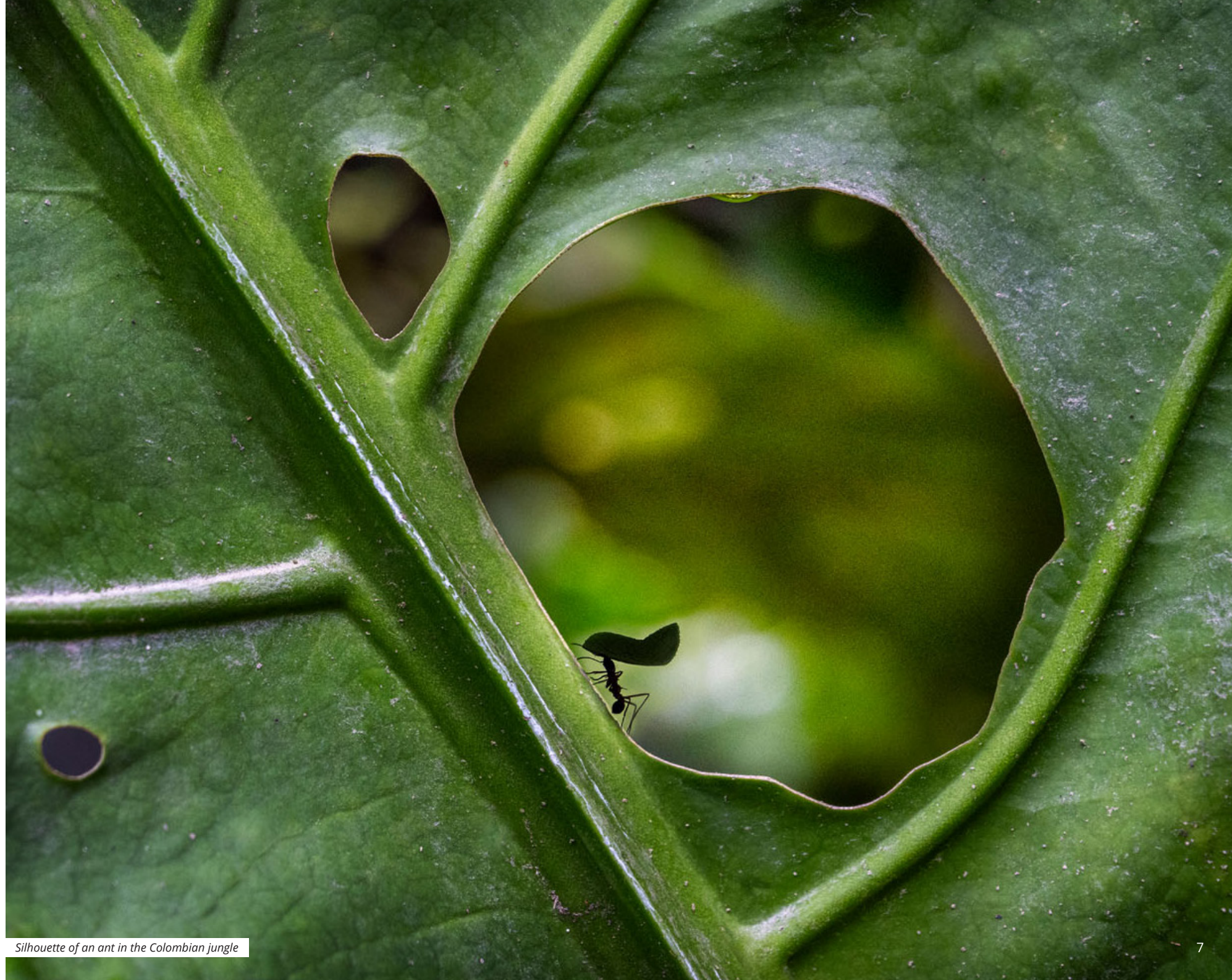
Silhouette of an ant in the Colombian jungle