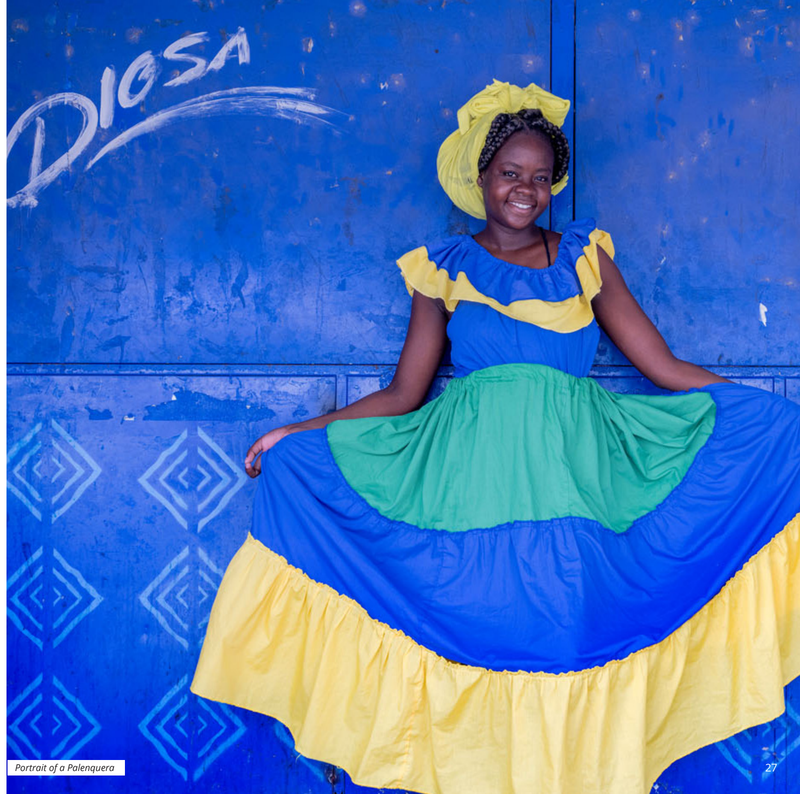
Portrait of a Palenquera