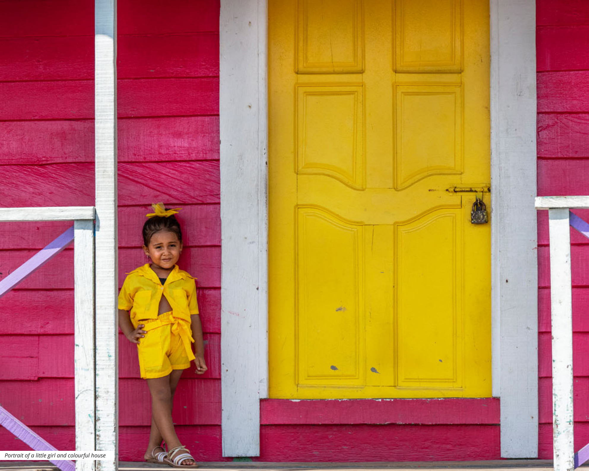
Portrait of a little girl and colourful house