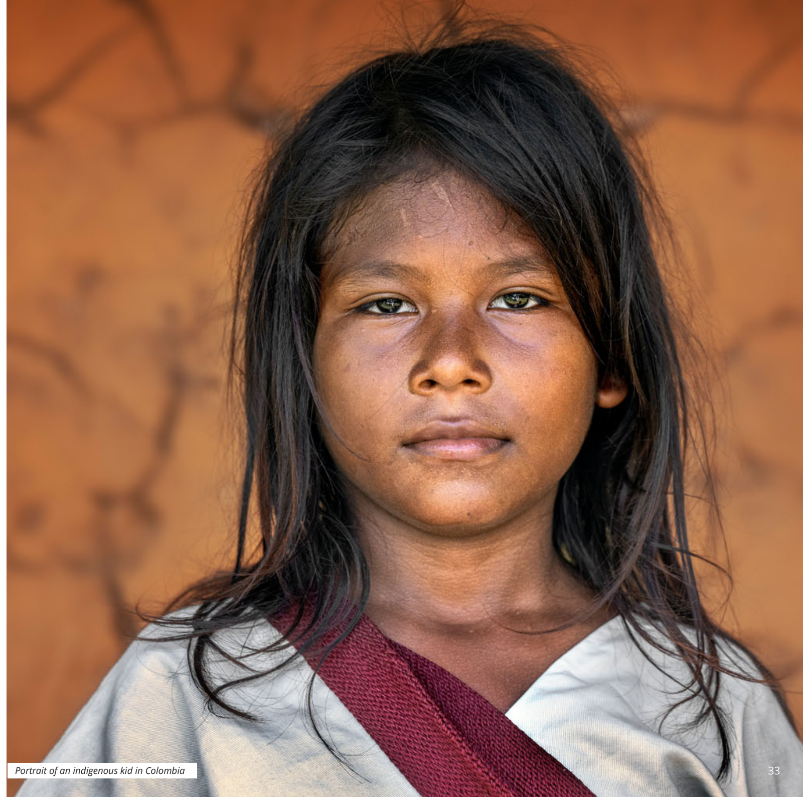
Portrait of an indigenous kid in Colombia

To reserve your place for 2026 or to make an enquiry, please email ignacio@iptravelphotography.com.au