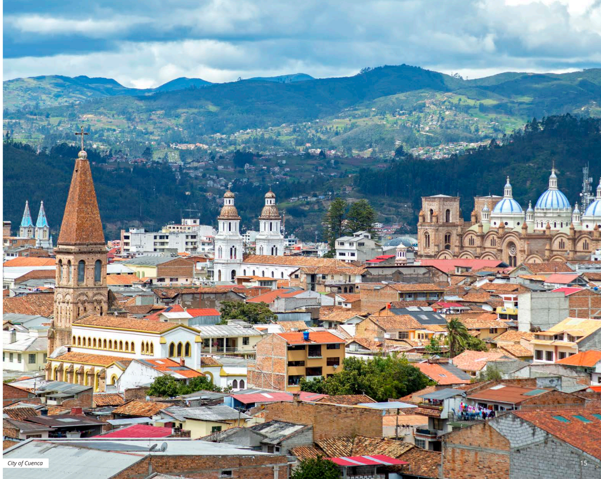
City of Cuenca

Accommodation: Unipark (first class) or similar.