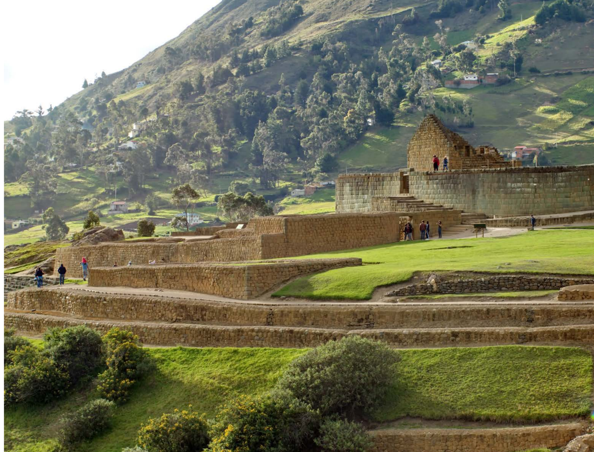
Temple of the Sun at the ruins of Ingapirca outside of Cuenca

Accommodation: Hacienda La Cienega or similar.