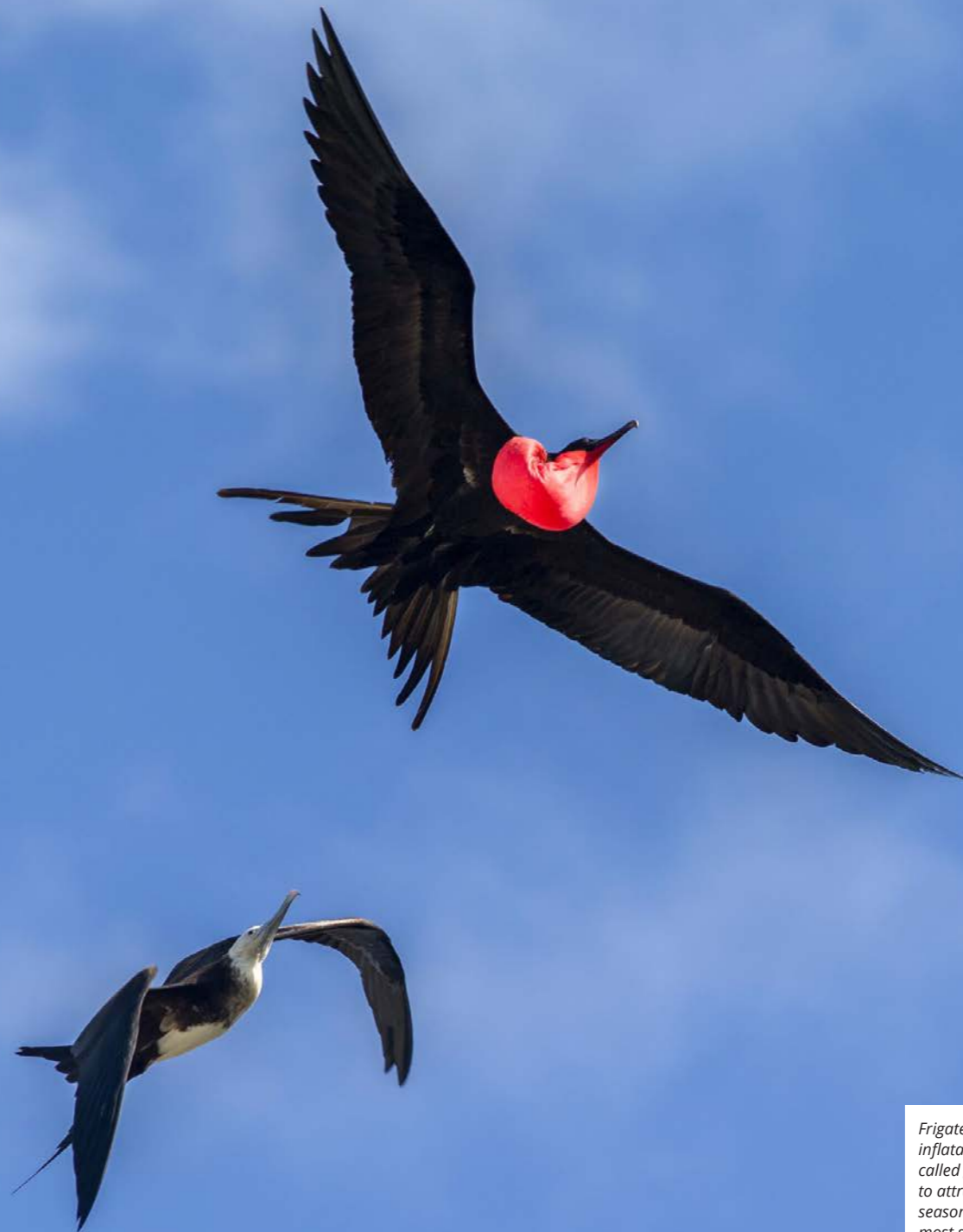
Frigatebird, Galapagos. The males have inflatable red-coloured throat pouches called gular pouches, which they inflate to attract females during the mating season. The gular sac is, perhaps, the most striking frigatebird feature.