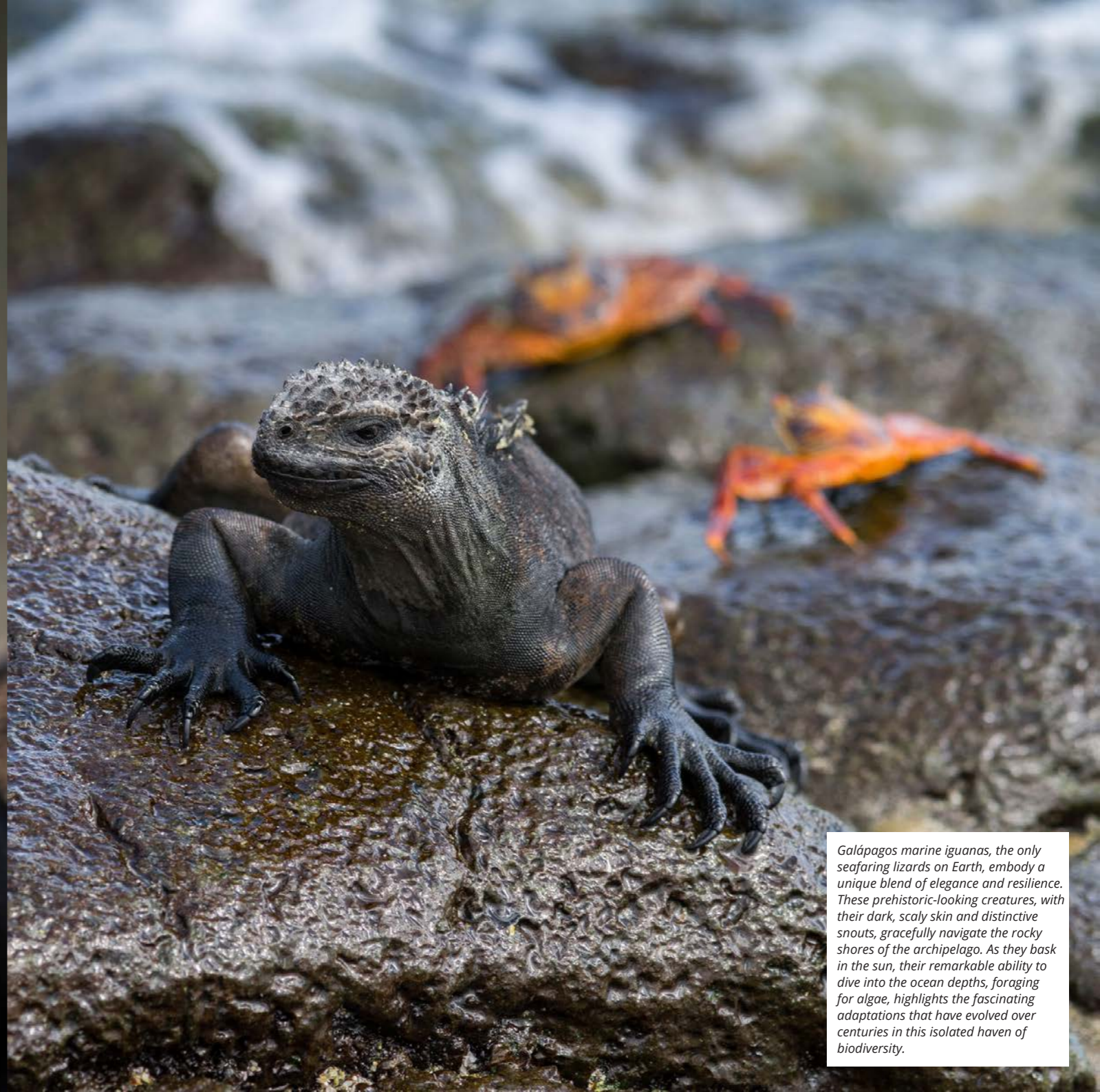
Galápagos marine iguanas, the only seafaring lizards on Earth, embody a unique blend of elegance and resilience. These prehistoric-looking creatures, with their dark, scaly skin and distinctive snouts, gracefully navigate the rocky shores of the archipelago. As they bask in the sun, their remarkable ability to dive into the ocean depths, foraging for algae, highlights the fascinating adaptations that have evolved over centuries in this isolated haven of biodiversity.