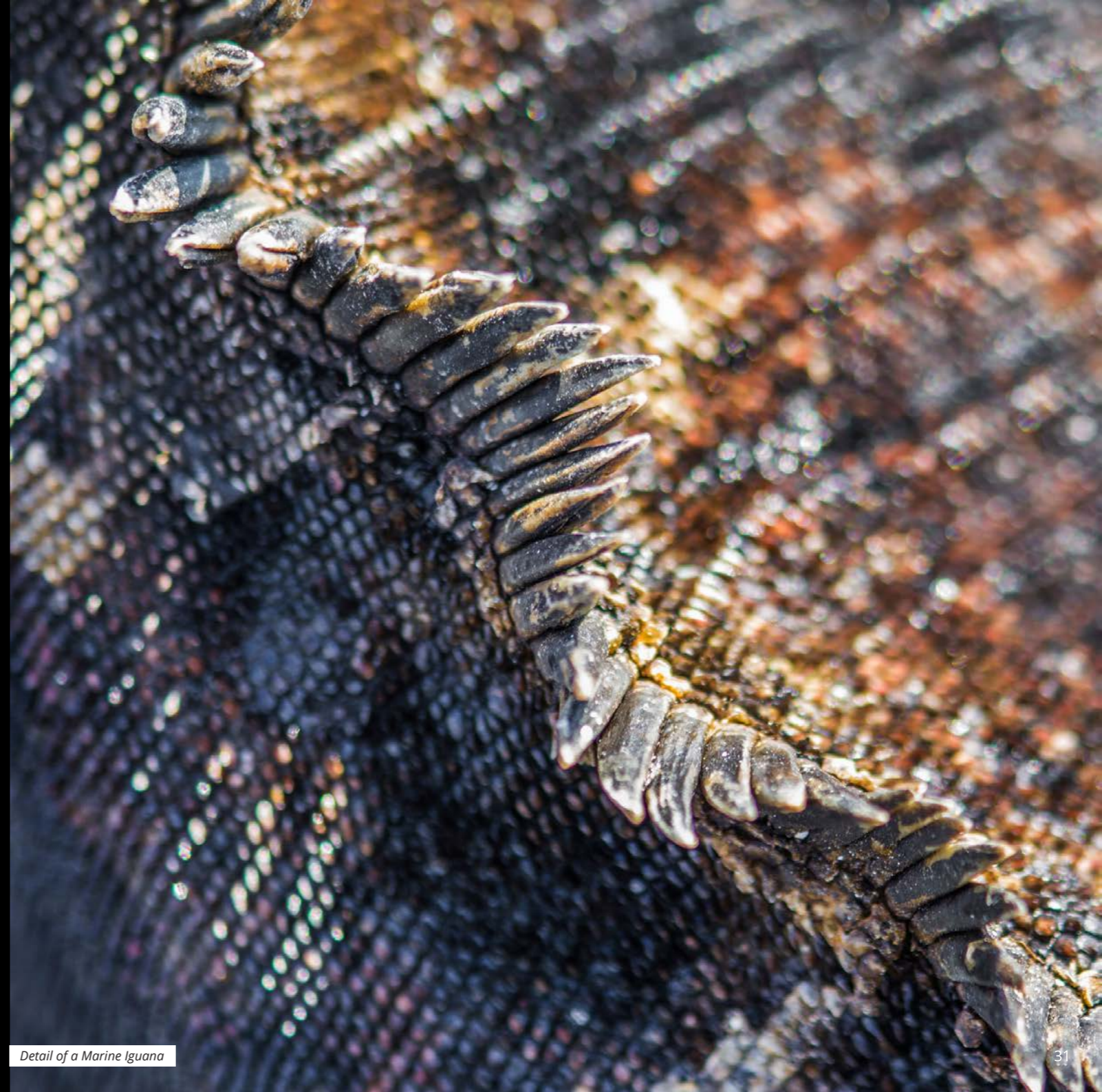
Detail of a Marine Iguana