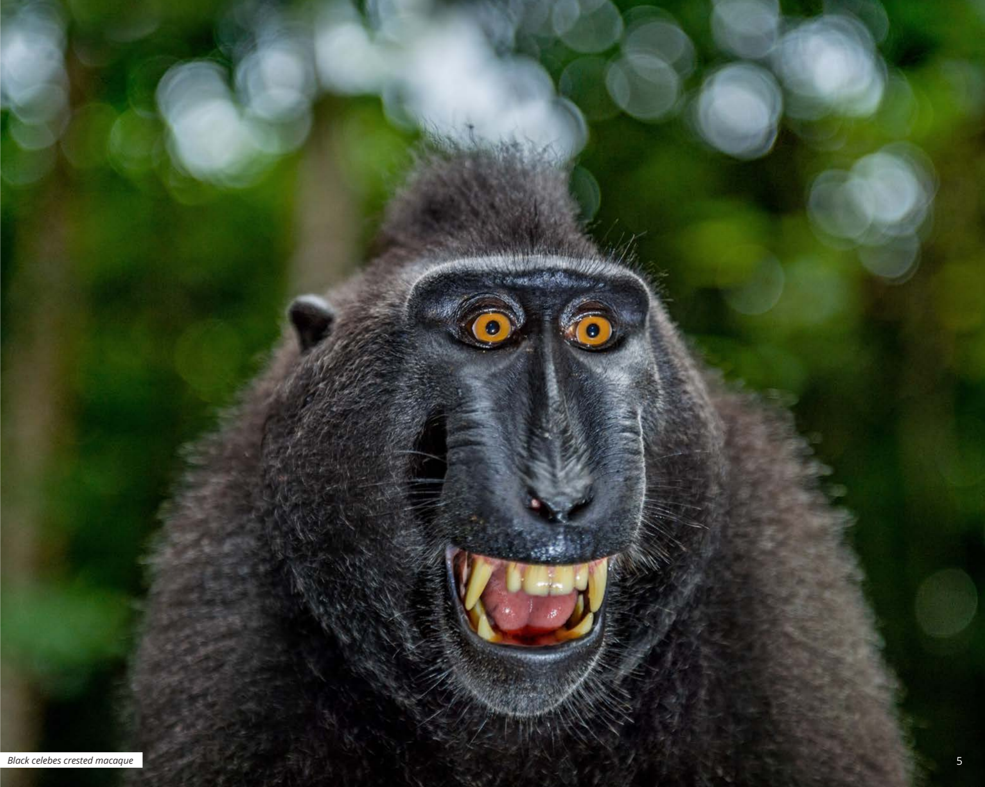
Black crested macaque