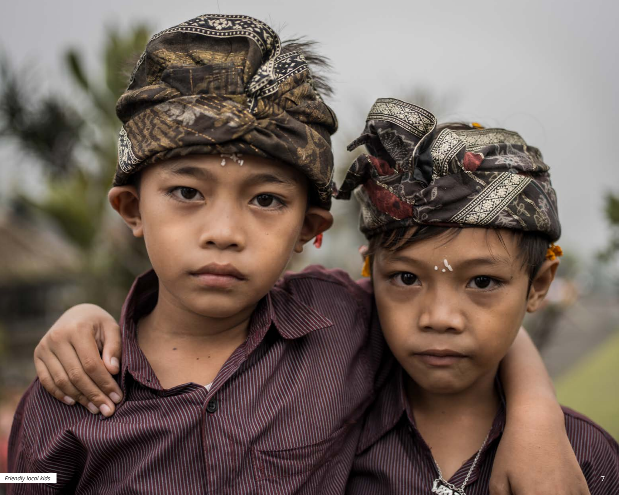
Friendly local kids