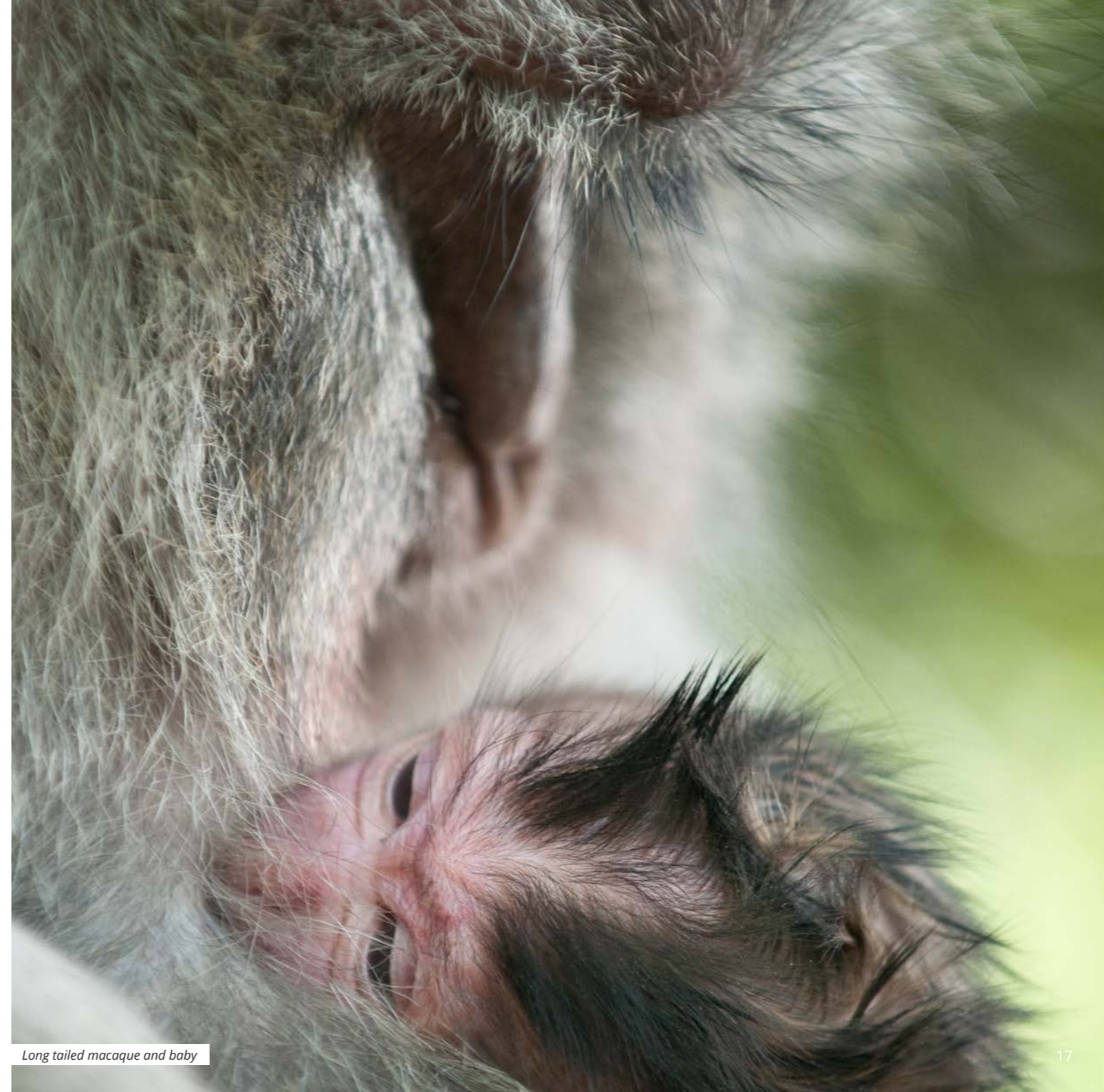
Long tailed macaque and baby

To reserve your place for 2024 or to make an enquiry, please email ignacio@iptravelphotography.com.au