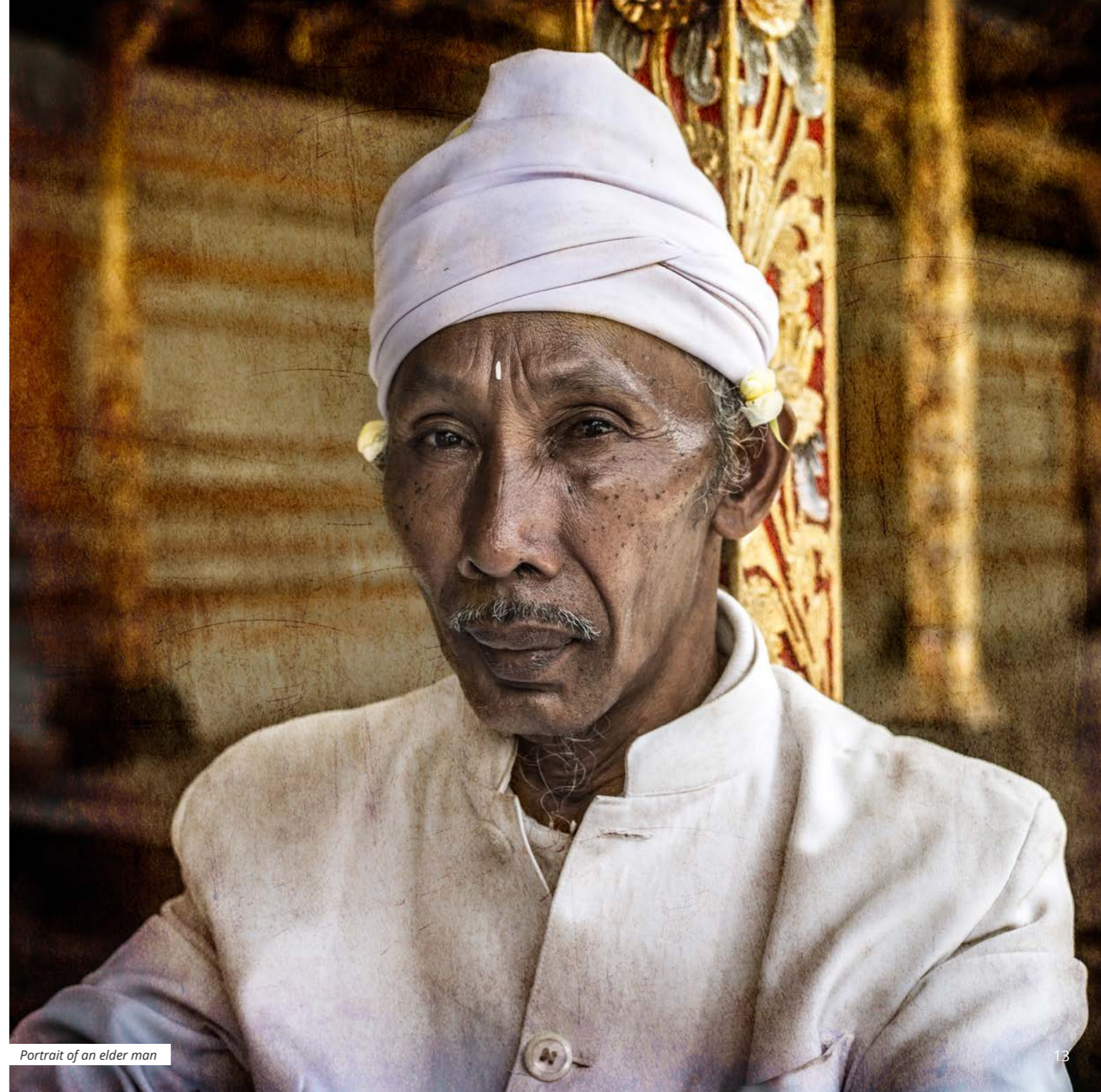
Portrait of an elder man